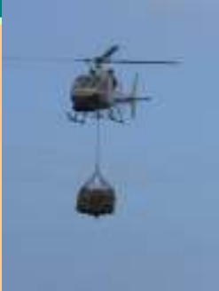
The tortoises are being brought to Round Island by helicopter

The 27 th June 2007 marked a historic day as tortoises were returned to Round Island after being absent for over a century. Two species of giant tortoises once roamed pristine Mauritius, acting as important grazers & seed dispersers. Consequently, their extinction impacted the Round Island ecosystem.