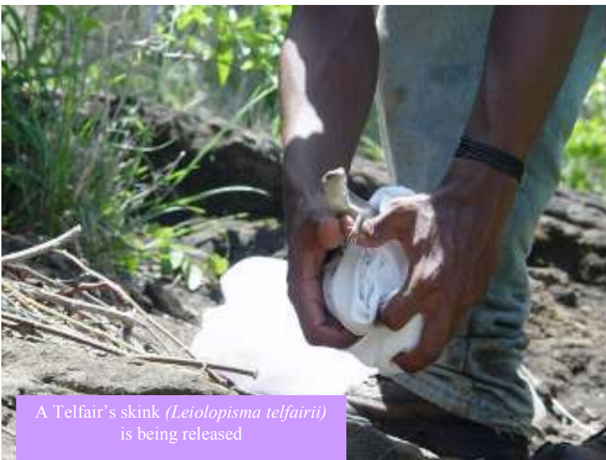
A Telfair's skink ( Leiolopisma telfairii ) is being released

The first sets of post translocation monitoring trips have now been completed. Monitoring involves visiting all of the islands (mentioned below) to: assess the health and disease, distribution, diet and habitat use of the translocated reptiles; survey the resident invertebrates & vertebrates and to obtain comparative data from the donor populations. All of this monitoring is to detect the success & impact of the translocations. This is however an ongoing process & will now continue seasonally for the duration of the three year project. So far all appears successful & the initial impacts are positive.