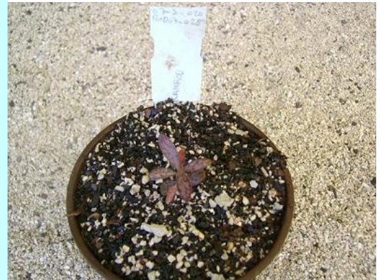
One of the seedlings of the Ramosmania rodriguesii

With these fantastic results there may be hope of avoiding yet another extinction of a Rodrigian plant species.